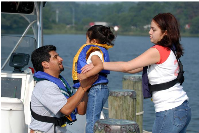
A family demonstrates proper PFD use in this photo from the NSBC.

Unique to the 2007 Campaign is Coast Guard funding targeted at Northern California’s Delta region. The NSBC, the State of California, the Coast Guard, and various local organizations are planning a “media blitz” for that area – with other states watching the effort closely.